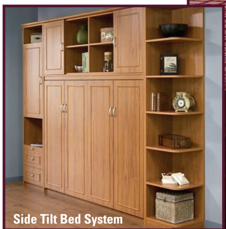
Side Tilt Bed System