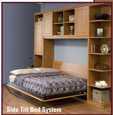
Side Tilt Bed System