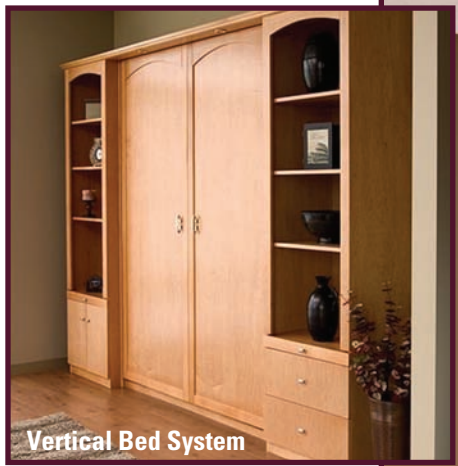
Vertical Bed System

Easily transform unused space into an outstanding feature with an elegant and practical Murphy Wall-Bed. Make more room for work, hobbies, games, guests and everyday living.